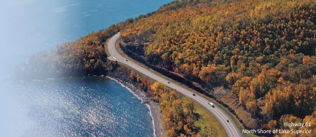
Highway 61 North Shore of Lake Superior