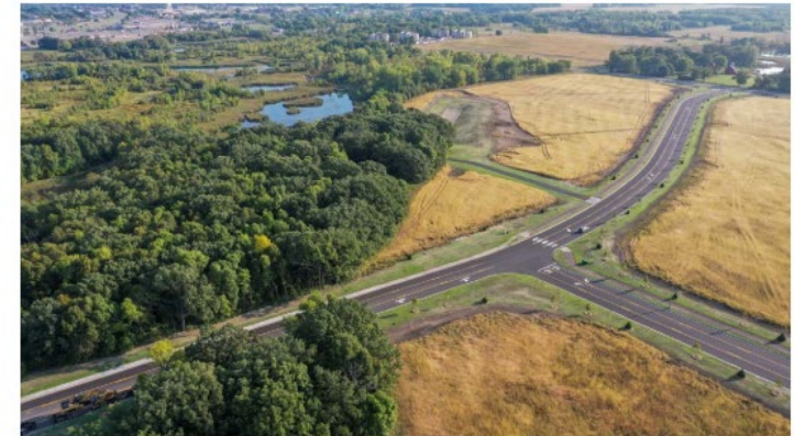
Alexandria 44th Avenue project