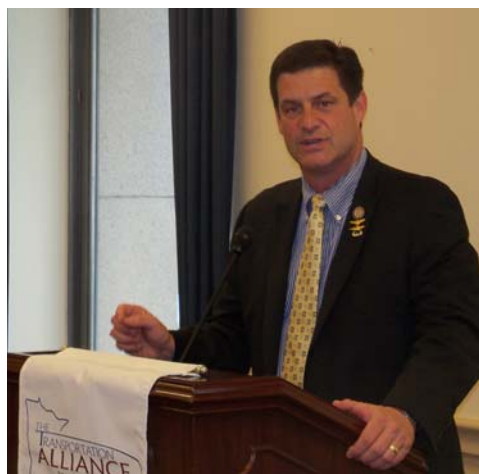
Representative Chip Cravaack