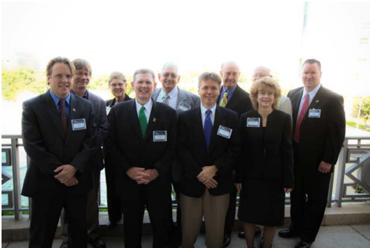
Representative Tim Walz